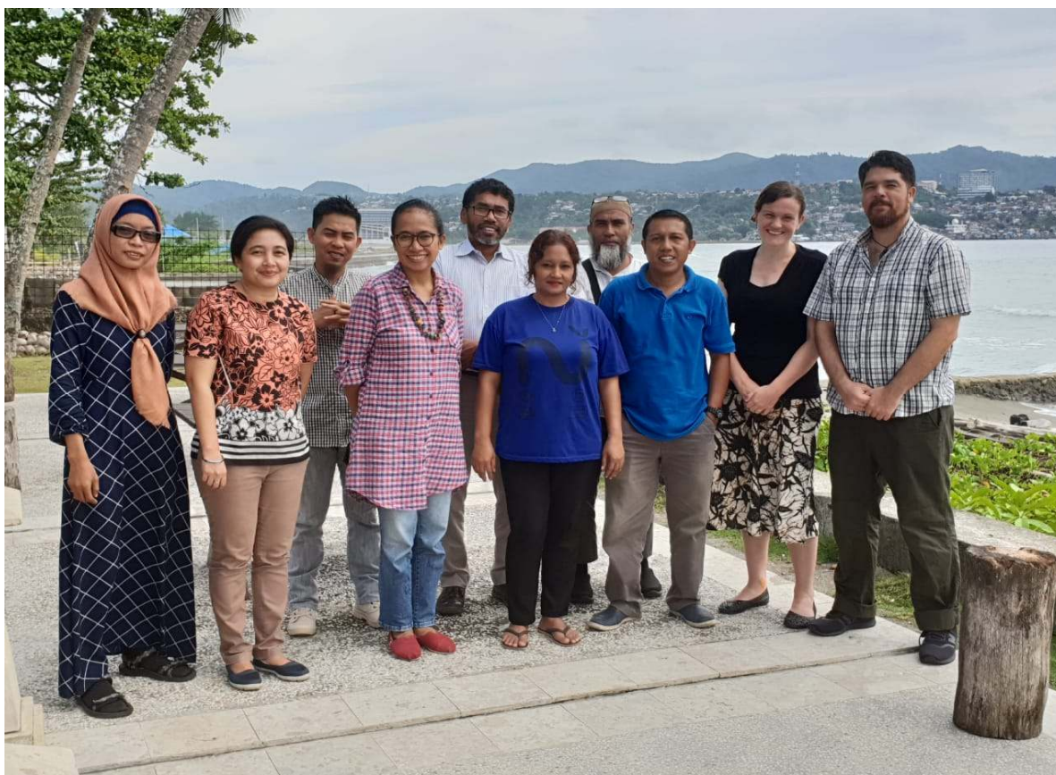
Figure 1: The NZMATES Programme team with Yayasan Mercy Corps Indonesia support staff in Ambon

This annual report corresponds to the first year of the NZMATES programme, from the programme start date (17 th of April 2018) to 31 st March 2019. As this was the first period of programme activities, there was a focus on set-up and establishment of the Programme Management Office (PMO), including recruitment, procurement and policy development, as well as stakeholder engagement, especially with key programme partners. Significant progress is also reported on Programme Framework reports. Pipeline activities are still in the early stages, however the workplan developed for the coming year includes an exciting mix of projects and locations. This report outlines progress towards programme outputs, and comments on early progress towards short-term outcomes as well.