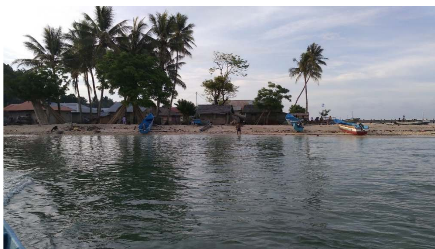
Figure 6: Dusun Haya, potential location for a new solar mini-grid in the NZMATES pipeline.

The NZMATES off-grid project pipeline is off to a good start, and substantive technical assistance work is due to begin in early April. While this is a slight delay relative to expectations, due primarily to the delay in the establishment of the PSG, the number of off-grid project support requests received has greatly exceeded expectations, meaning the NZMATES pipeline is on track to exceed the initial life-of-programme target of 15 projects supported. This is in part due to a large number of requests for support with refurbishment of broken solar and hybrid mini-grids, and the willingness to expand support (on a case-by-case basis) to other districts in Maluku outside Seram. The number of requests for support with new off-grid projects currently stands at 4, which is more in line with expected targets.