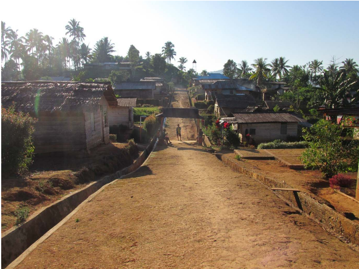
Figure 9: Manusa village, accessible only on foot, surveyed by the NZMATES team in October.