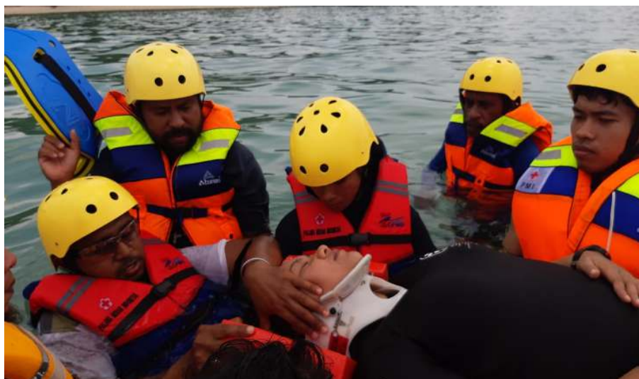
Figure 3: NZMATES team members are trained in marine rescue techniques by the Indonesian Red Cross.

The field and office teams have undertaken first aid training by the Indonesian Red Cross and further training will be procured in the second year to ensure all critical aspects of risk management are covered.