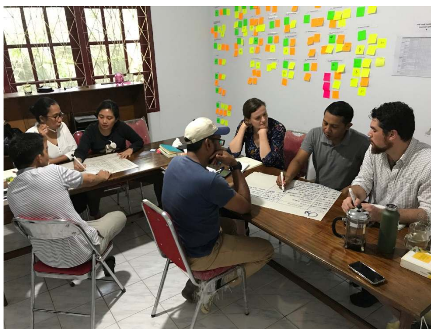
Figure 2: NZMATES staff prepare community mapping tools in the PMO.

The PMO in Ambon is located in the existing Yayasan Mercy Corps Indonesia (YMCI) Ambon field office, where an existing Administration, Logistics and Procurement Officer and a Senior Finance Officer provide part-time support to the NZMATES programme, along with a team of operational support staff including driver, security staff, and cleaner.