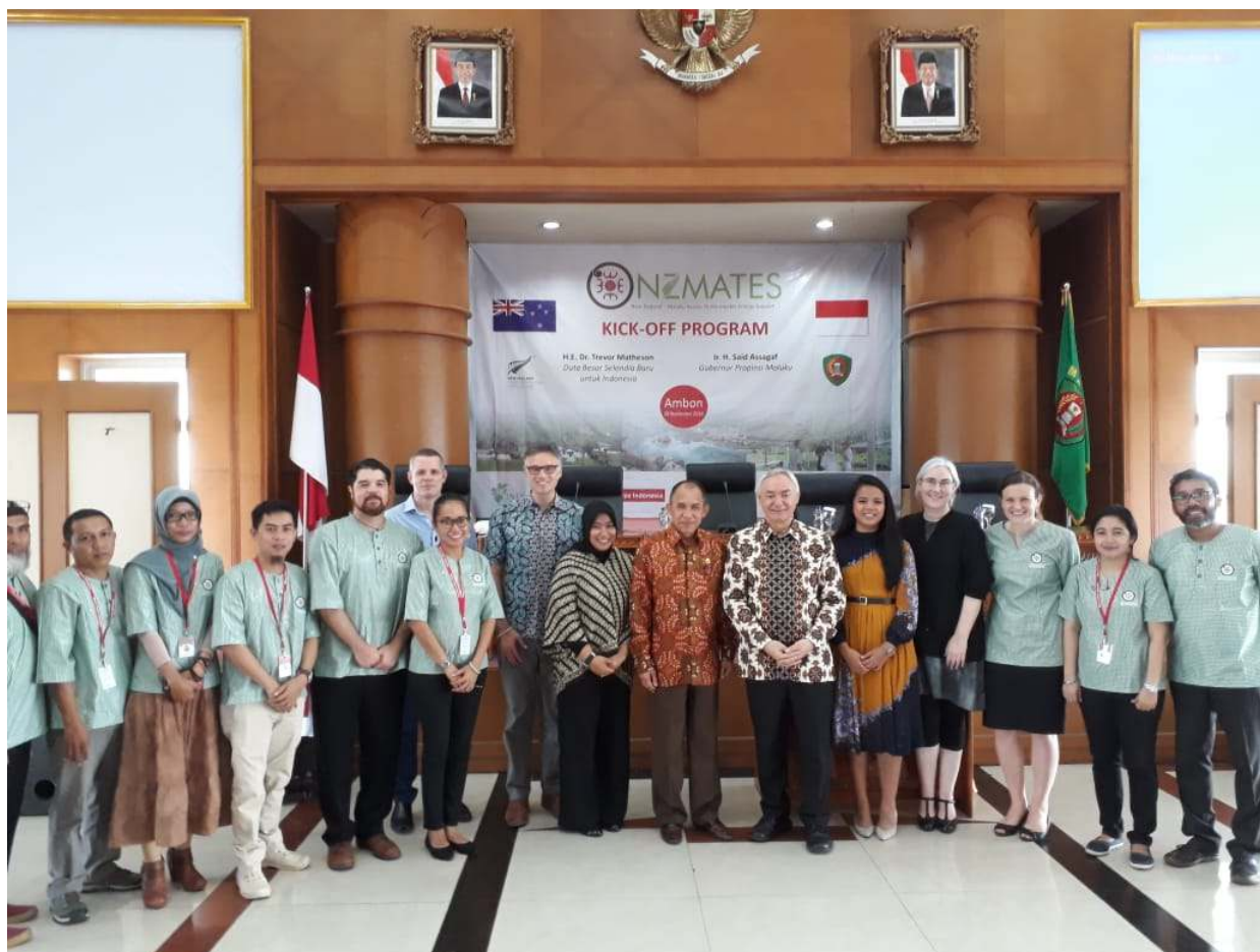
Figure 4: The NZMATES team and staff from the New Zealand Embassy in Jakarta at the NZMATES kick-off event, together with the New Zealand Ambassador and Governor of Maluku.

Working groups were set up at the provincial level with PLN and Dinas ESDM, and through these groups work plans for NZMATES' technical support were developed. The number of requests for support far exceeded initial expectations, a testament to the value partners see in the collaboration with NZMATES.